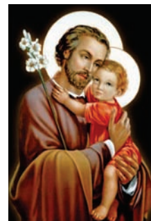
St. Joseph, Pray for us.

5:00 pm : For the Intentions of St. Joseph Parish Community