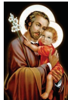
St. Joseph, Pray for us.