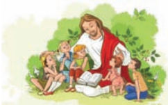
CHILDRENS' LITURGY AT SUNDAY MASS

CHILDRENS' LITURGY: The Liturgy of the Word with Children during the Sunday 10:00 a.m. mass each week. This ministry is for school-children 4 years old and up. Special thanks to coordinators and volunteers who are dedicated to this important ministry for our children. Our trained leaders help the children to understand the readings of the day through prayers, discussions and activities.