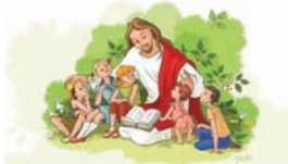
CHILDREN'S LITURGY AT SUNDAY MASS

We pray those persons living on the margins of society, in humane life conditions: may they not be overlooked by the institutions and never considered of lesser importance.