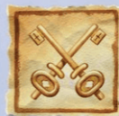
Penance and Reconciliation